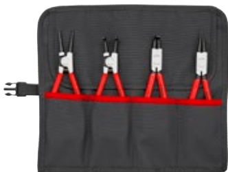
00 19 56