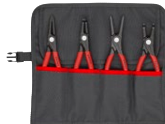
00 19 57 V01