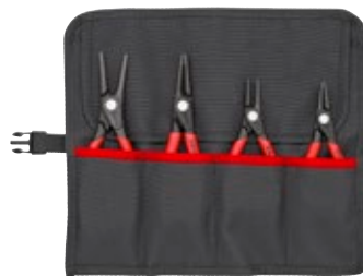
00 19 57