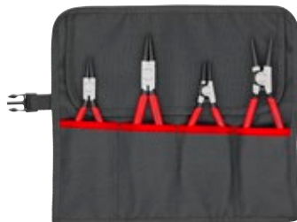
00 19 56 V01