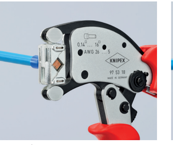
Uniquely flexible: connectors can be inserted in the rotatable crimp head from almost any position