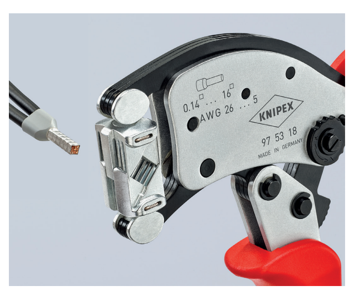
Twin end sleeves (ferrules) up to 2 x 6 mm<sup>2</sup> can be crimped without adjustment