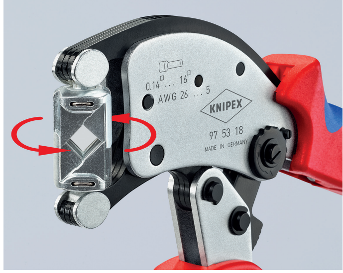
Crimp head can be rotated 360° for optimal accessibility, even in confined spaces