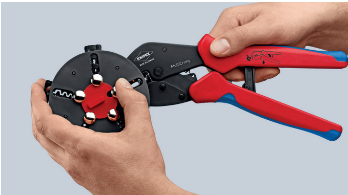
2. Changing the crimp die: unlock the magazine position, take the crimp dies out of the pliers