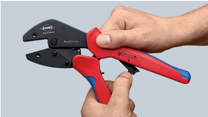
1. Changing position: service lever opens out for parallel jaw positioning