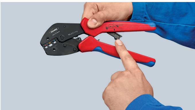
3. Fold in the service lever and press the pliers – ready for use again