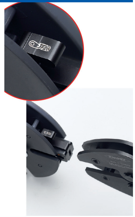
Magazine for crimp dies can be carried on a belt