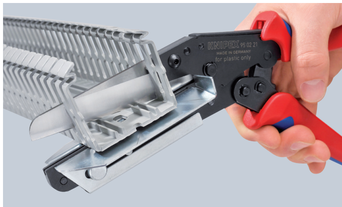
95 02 21: Blade length 4 1/4" (110 mm) for cutting wide cable ducts