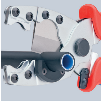
Composite pipes of 1/2" – 1" (12–25 mm) dia. are cut cleanly and without deformation