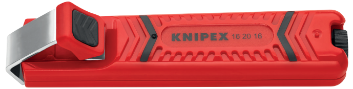
16 20 16 SB ⌘