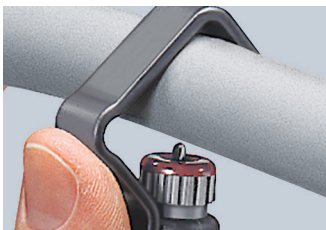
Setting the tool for circular cutting