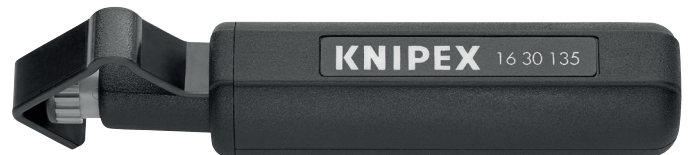
16 30 135 SB ⌘