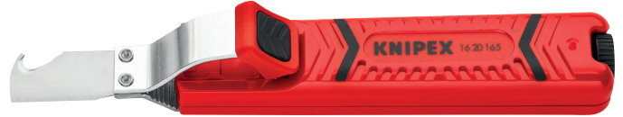
16 20 165 SB ⌘