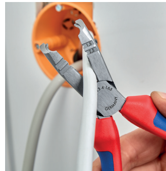
Cutting cable up to Ø 13 mm