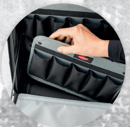
Removable, half-height tool panel