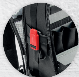
FIDLOCK® adapter with fabric loop