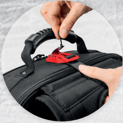
Patented magnetic FIDLOCK® connectors evenly distributes load weight