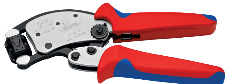
97 53 19