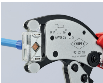
Crimp end sleeve (ferrules) fully automatically within the capacity of each tool