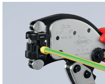
Uniquely flexible: connectors can be inserted in the rotatable crimp head from almost any position