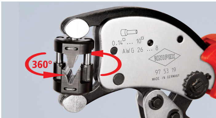
Rotating crimping head for optimal accessibility, even in confined areas