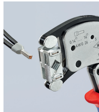
Twin end sleeves (ferrules) up to 2 x 10 AWG (2 x 6 mm 2 ) can be crimped without adjustment