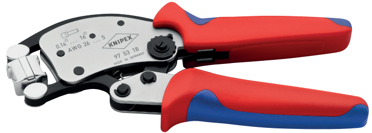
97 53 18