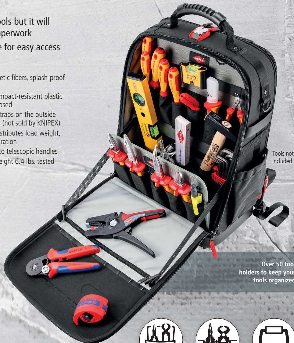
Tools not included

Over 50 tool holders to keep your tools organized