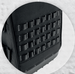
Carabiners or adapters can be attached to the MOLLE straps and combined in almost any way (not sold by KNIPEX)