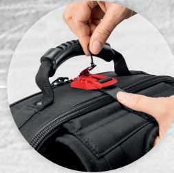
Patented magnetic FIDLOCK® connectors evenly distributes load weight