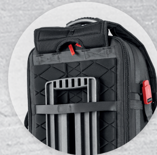
The luggage strap allows convenient attachment to telescopic handles