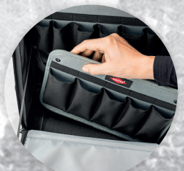
Removable, half-height tool panel