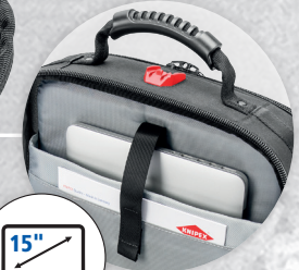
Separate laptop compartment