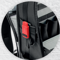
FIDLOCK® adapter with fabric loop