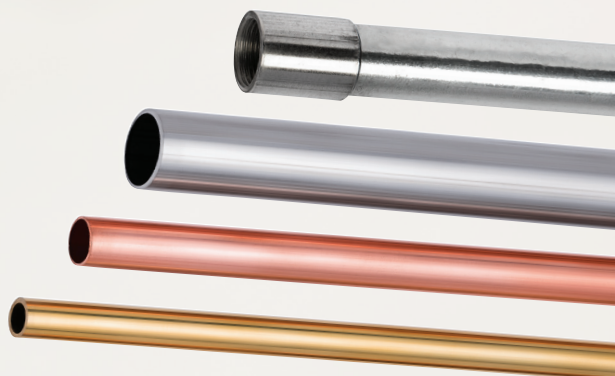
For cutting copper, brass and stainless steel pipes with a wall thickness up to 5/64" (2 mm) and diameters from 1/4" - 3" (6 to 76 mm)