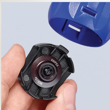
Spare cutting wheel and needle-bearing is stored in the blue handle