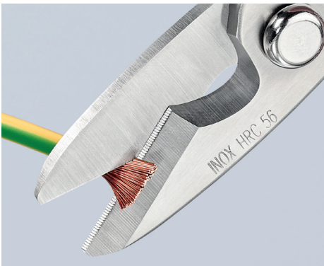
Fine serration for precise cutting.