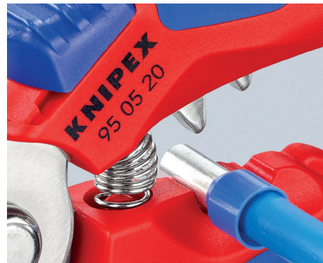
Two crimping areas for standard wire ferrules sizes.