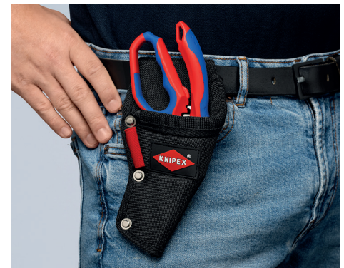
Fabric belt pouch available separately.