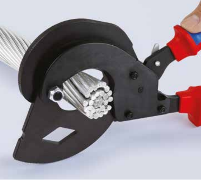
Enormous power with a weight of just 2.87 lbs (1300 g)