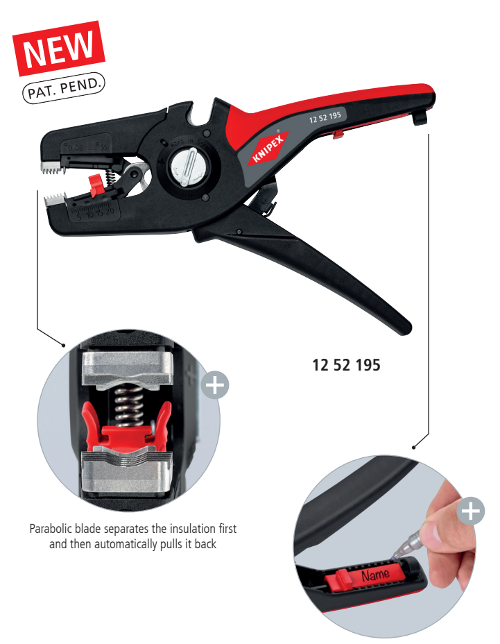
Customisable using the inscription area

The parabolic bulging blade pair (red) extensively encloses and cuts the insulation and is thus suitable for many flexible materials