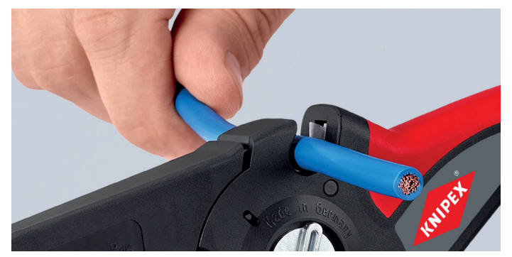
With cable cutter on the top side for up to 16 mm<sup>2</sup>