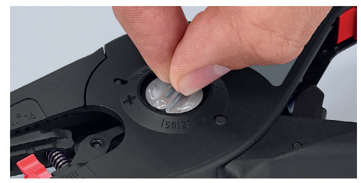
For special requirements, such as particularly hard or soft insulation materials, optimum fine adjustments can be made using the adjustment wheel with its tactile locking positions